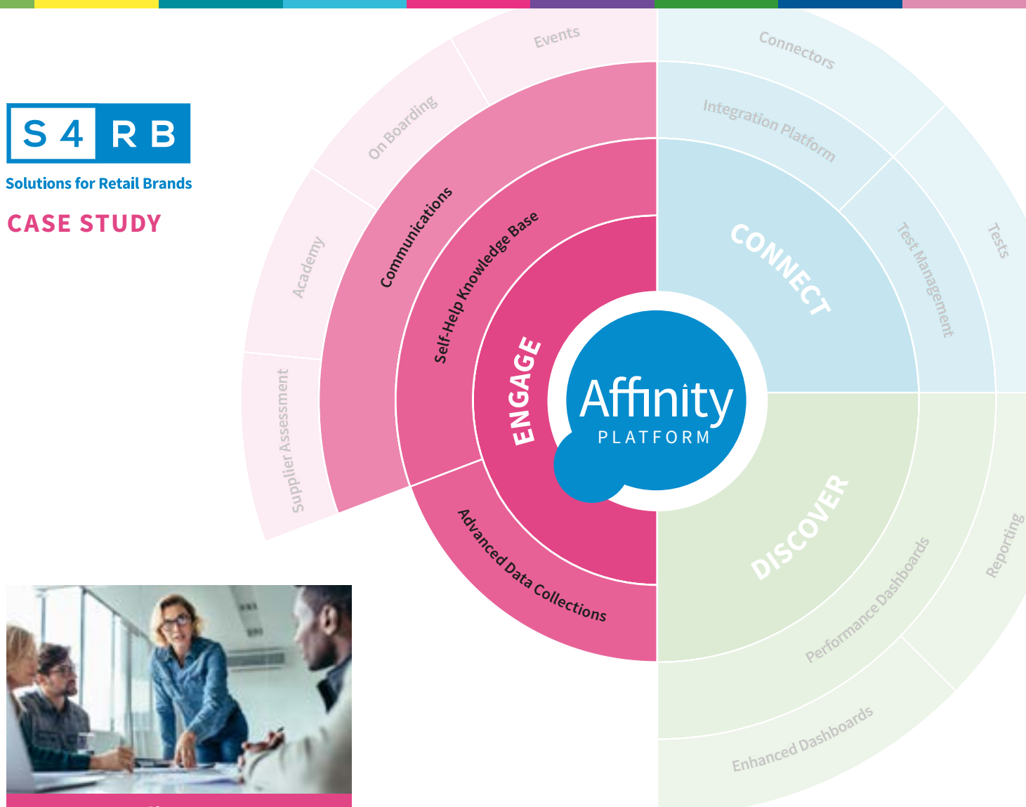
Focus: Supplier engagement